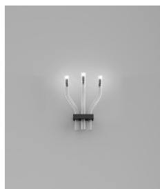
STRDU AP 3