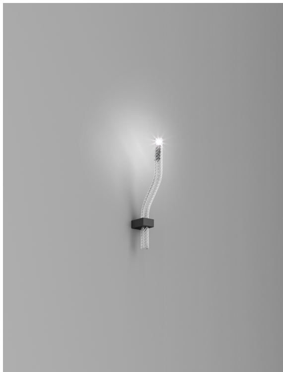
STRDU AP 1 CRRI NN G9 CE